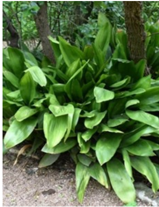
Cast Iron Plant

Our church campus is a beautiful space, and we want to keep it that way! We're organizing a workday for the front of the church to make it an even more welcoming for everyone. Enjoy the fellowship and the satisfaction of making our campus look its best!